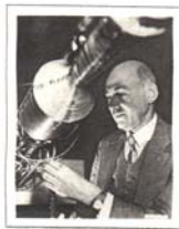
FIRST DAY OF ISSUE