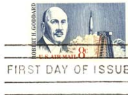
FIRST DAY OF ISSUE